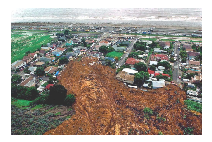
Fig. 3. Landslide at La Conchita, Ventura, California, on 10 January 2005, destroyed 13 houses, severely damaged 23 others, and killed 10 people (Jibson, 2005).

Models help scientists address the complexity of landslide occurrence and behavior, for example at La Conchita in Ventura, California (Fig. 3). In 1995, a landslide consisting of a relatively coherent block of earth at La Conchita caused property damage but no fatalities. Ten years later, another landslide remobilized from the 1995 deposit, transformed rapidly into a highly fluid debris flow, and traveled downslope at a speed of 5 to 10 \,\mathrm{m \, s^{-1}} , causing 10 fatalities (Jibson, 2005). Landslide models can serve as useful tools for officials charged with public safety, by allowing the officials to estimate the changes in slope stability that might occur under varying rainfall, land use, and other scenarios. The models use a combination of geologic, topographic, hydrologic, geotechnical, and land use/land cover factors to estimate the probability of hillslope failure. Scientists use locally- to regionally-derived data to calibrate the landslide models, which are then used to predict where, and under what conditions, landslides are likely to occur.