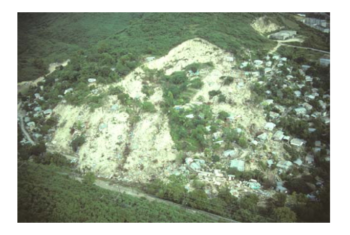
Fig. 1. Aerial view of Barrio Mameyes, Ponce, Puerto Rico, following October 7, 1985 landslide disaster (Jibson, 1989). Before the landslide, the area of exposed bedrock in the center of the photograph had a comparable density of small one-story houses as is seen on right side of photograph. (Photo from R. Jibson, USGS).

of rainfall-triggered landslide disasters in Puerto Rico and Venezuela where anthropogenic factors were significant, and discusses approaches for hazard mitigation.